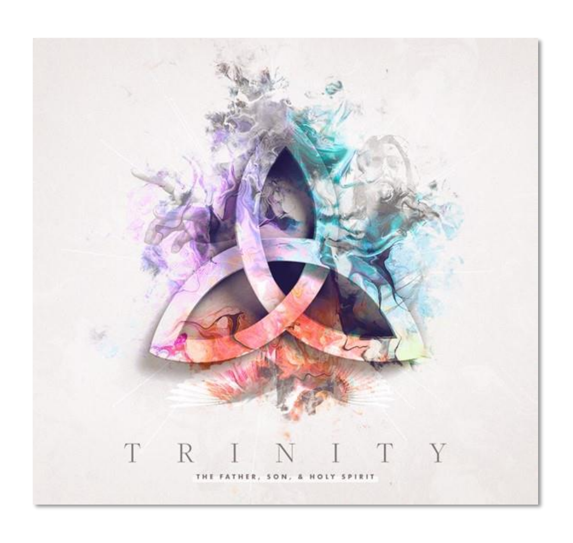
St. John's Lutheran Church June 4, 2023